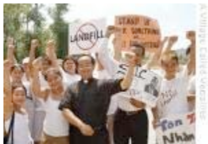
Người dân Versailles mạnh mẽ phản đối kế hoạch của chính quyền

Hàng trăm người đã tới dự các buổi điều trần công khai về vấn đề này. Lần đầu tiên, người ta có thể cảm nhận được sự hiện diện của người gốc Việt ở New Orleans. Một cuộc diễu hành ở Tòa Thị Chính đã buộc thị trưởng Nagin phải cam kết sẽ ngưng đổ chất thải cho tới khi nào các cuộc kiểm nghiệm được tiến hành nhằm bảo đảm sự an toàn của bãi rác, nhưng ông đã không giữ lời hứa.